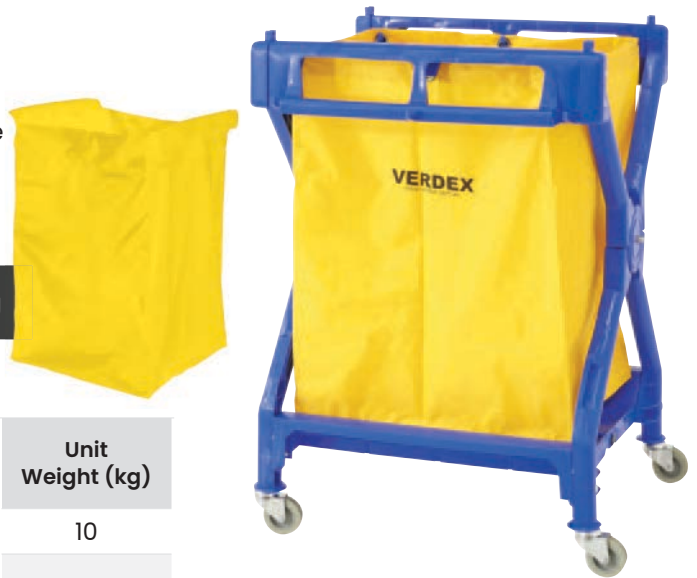
M9071 Replacement Bag