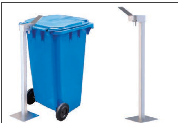
Single Wheelie Bin Stand (with Base Plate)