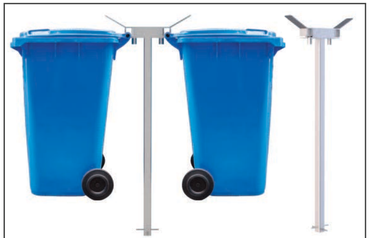
Double Wheelie Bin Stand (Inground)