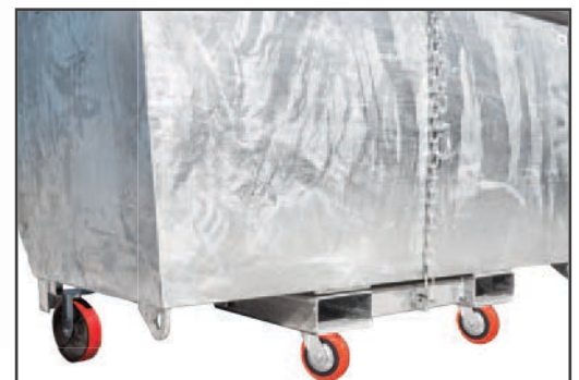
Optional Wheel Kit Available