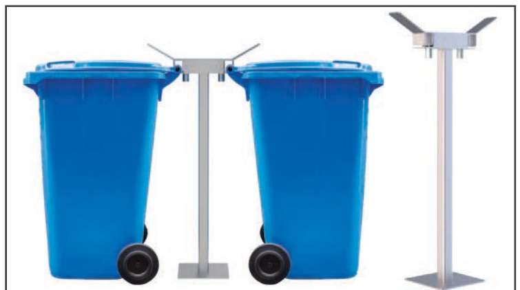
Double Wheelie Bin Stand (with Base Plate)