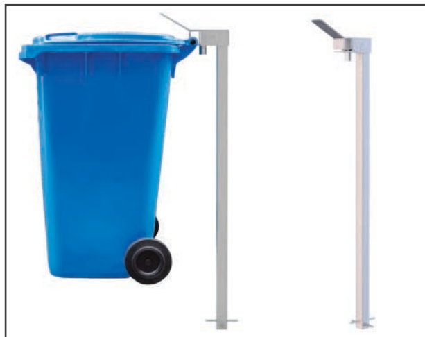
Single Wheelie Bin Stand (Inground)