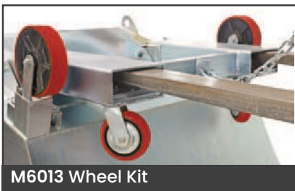
M6013 Wheel Kit