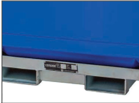
Fork pockets for forklift attachment