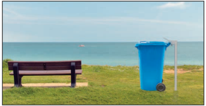
M6386 Single Wheelie Bin Stand Mount to suit 120L & 240L Bins