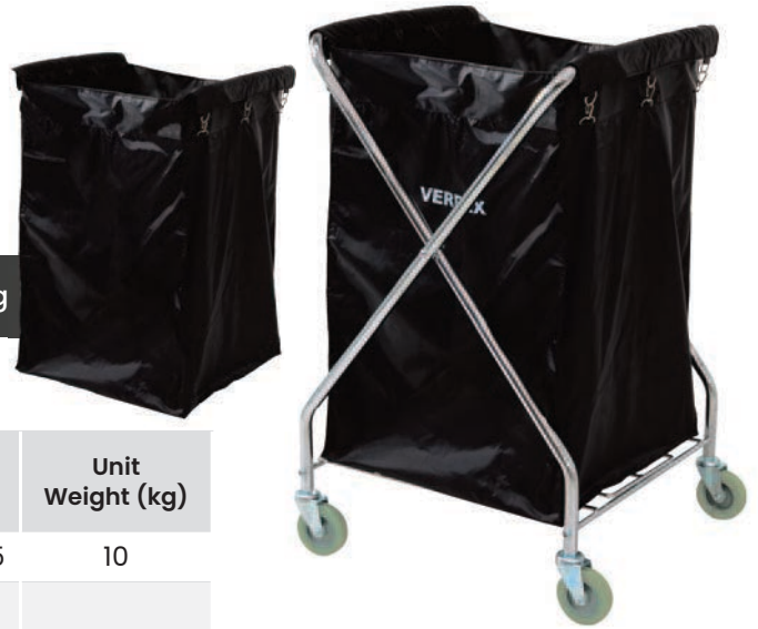
M9061 Replacement Bag