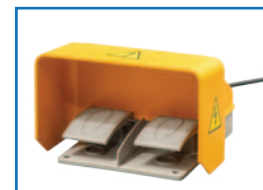
Foot Pedal to raise and lower platform