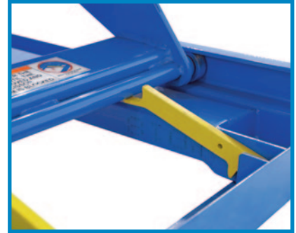
Rollers are entrapped in the base frame and platform for added stability