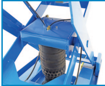
Patented self-contained pneumatic system offers unsurpassed performance