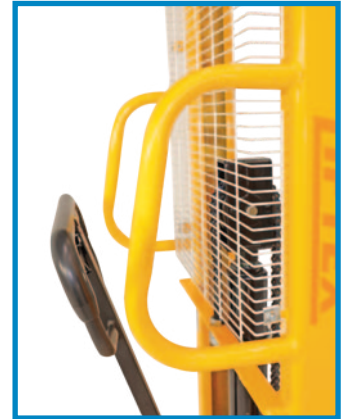
Handles for easy manoeuvrability