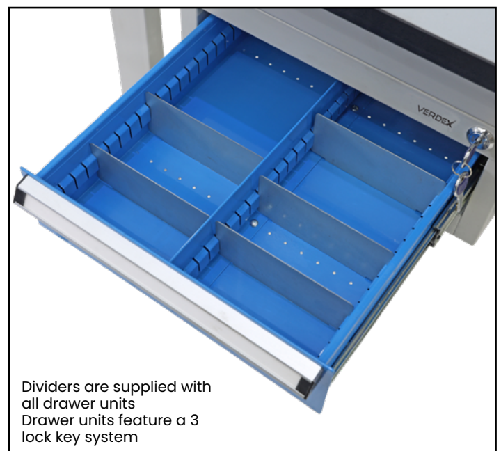
Dividers are supplied with all drawer units Drawer units feature a 3 lock key system