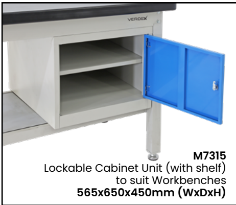
M7315 Lockable Cabinet Unit (with shelf) to suit Workbenches 565x650x450mm (WxDxH)