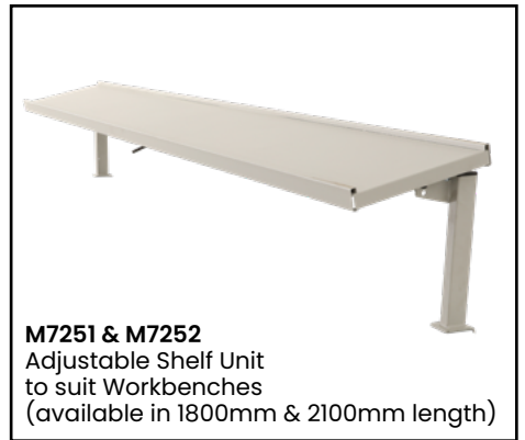
M7251 & M7252 Adjustable Shelf Unit to suit Workbenches (available in 1800mm & 2100mm length)