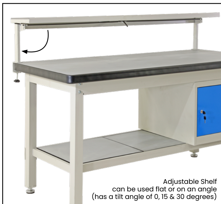
Adjustable Shelf can be used flat or on an angle (has a tilt angle of 0, 15 & 30 degrees)