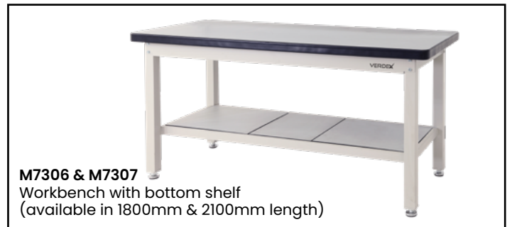
M7306 & M7307 Workbench with bottom shelf (available in 1800mm & 2100mm length)