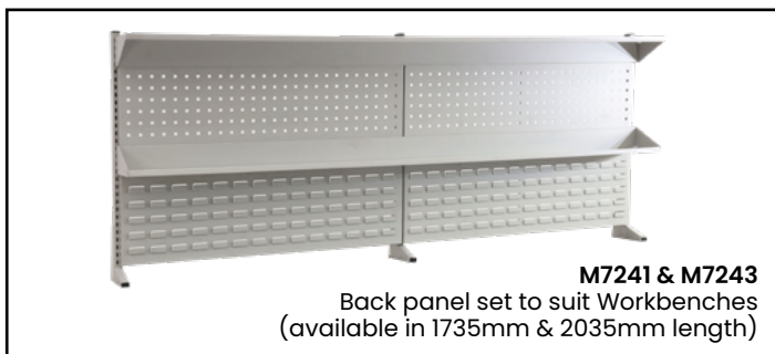
M7241 & M7243 Back panel set to suit Workbenches (available in 1735mm & 2035mm length)