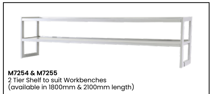
M7254 & M7255 2 Tier Shelf to suit Workbenches (available in 1800mm & 2100mm length)