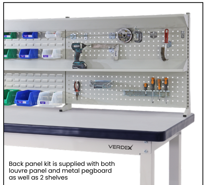
Back panel kit is supplied with both louvre panel and metal pegboard as well as 2 shelves