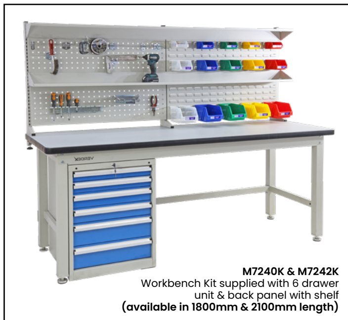
M7240K & M7242K Workbench Kit supplied with 6 drawer unit & back panel with shelf (available in 1800mm & 2100mm length)