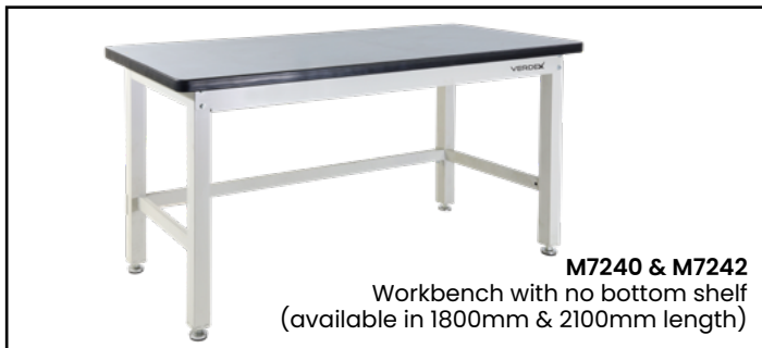
M7240 & M7242 Workbench with no bottom shelf (available in 1800mm & 2100mm length)