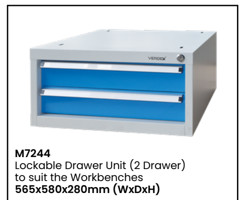
M7244 Lockable Drawer Unit (2 Drawer) to suit the Workbenches 565x580x280mm (WxDxH)