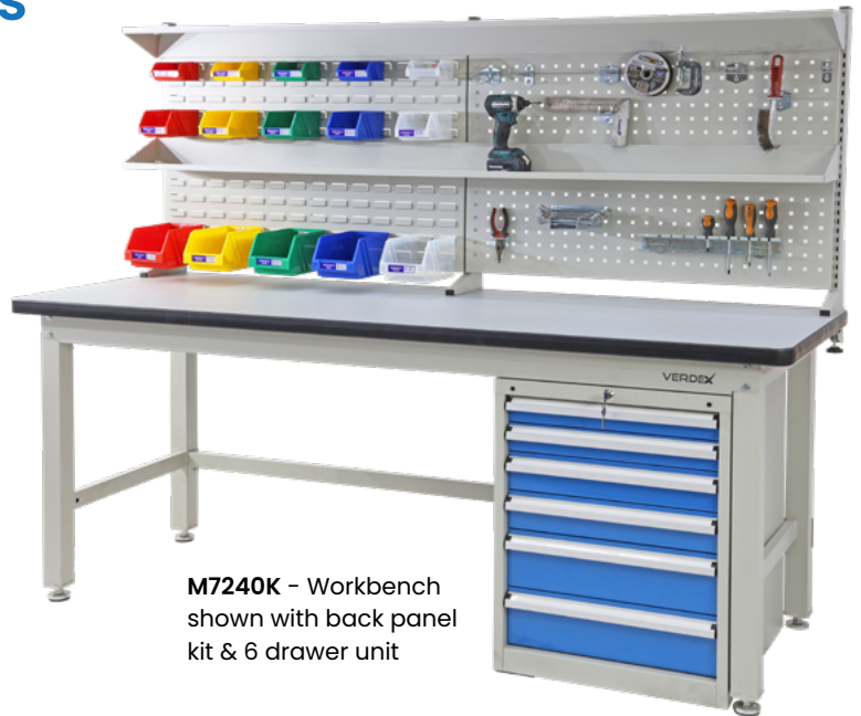
M7240K – Workbench shown with back panel kit & 6 drawer unit