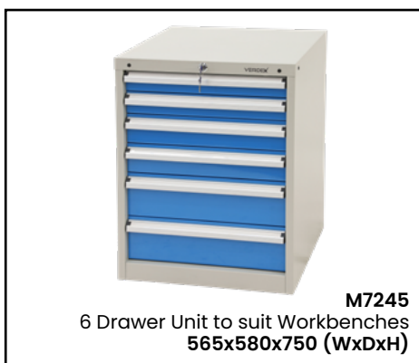
M7245 6 Drawer Unit to suit Workbenches 565x580x750 (WxDxH)