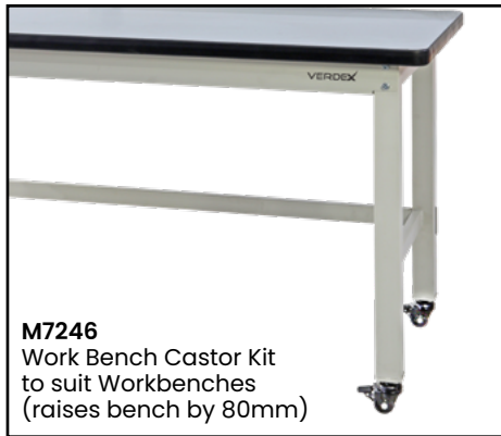
M7246 Work Bench Castor Kit to suit Workbenches (raises bench by 80mm)