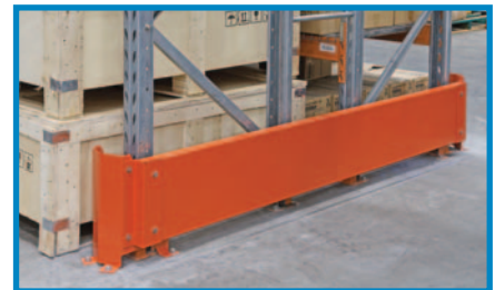
M7405 (to suit single bay of racking)