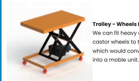
Trolley - Wheels Mounted We can fit heavy duty lockable castor wheels to the base frame which would convert your lift table