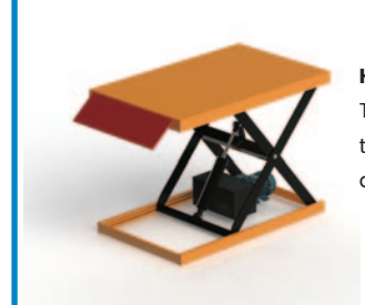
Hinged Loading Flap This can be mounted to the lift table to bridge the gap between loading docks, work areas or vehicles.